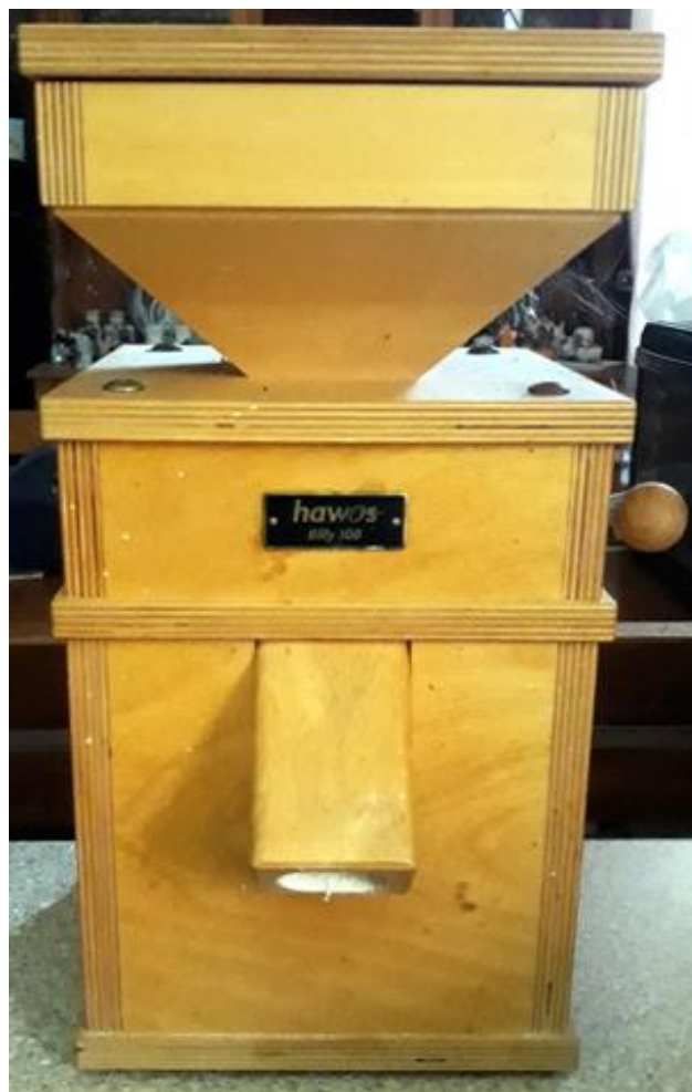
The newer fancy electric one!

The nutrition behind the use of the wheat base is very sound. There are plenty of goodies locked away within the humble wheat grain, a useful mix of protein, carbohydrates (sugars, starches and fibre) fats, vitamins and minerals . Thus, it is not good idea to replace wheat with say white rice, which is a source of carbohydrates only, although that is not to say that white rice should not be stored in addition to wheat.