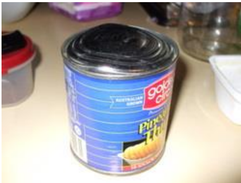
This can of pineapple slices was over 5 years old when it 'blew'.

There is usually no prejudice against tinned fruit and most members of the family can eat and enjoy it. Tinned pineapple is more versatile than most fruits as it can be eaten in hot or cold dishes, and it has a longer shelf life than other fruits (2 years as opposed to 1 year) . Pineapple juice (available in 3 litre cans) also has a longer shelf life than other juices except tomato. Another point in its favour is that it is 100% juice not a so-called fruit "drink" ie diluted with water.