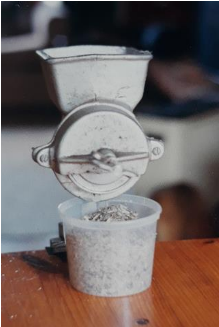
Our original grinder

Wheat has a myriad of uses, it can be ground to make flour and turned into bread, pasta, gluten products sourdough etc or used whole to grow sprouts or cook up as a cereal, the list is endless . To make maximum use of your stored wheat (and other stores) you should obtain a copy of the book "Passport to Survival" by Esther Dickey.