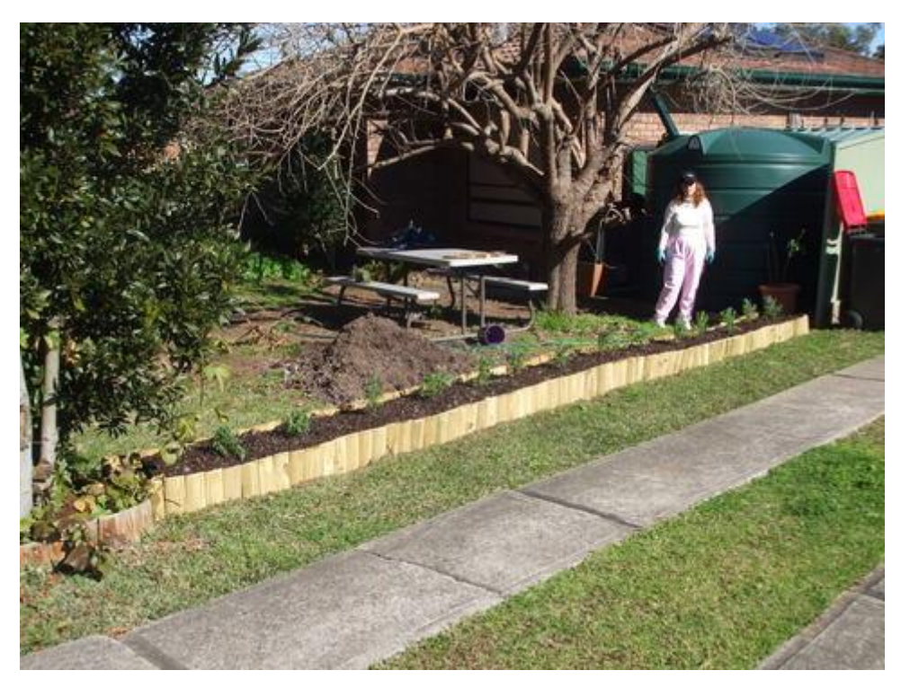
2012 when they were first put in

Back in 2012 I built a long but narrow raised bed, filled it with mushroom compost and installed a series of twelve lavender plants along it. I then set up a simple but effective watering system to keep them hydrated. In the intervening years we have had scorching hot, dry and then supremely wet conditions. Of the original twelve we still have six plants existing, but I need to redo the area and replace the lavender plants that have passed on.