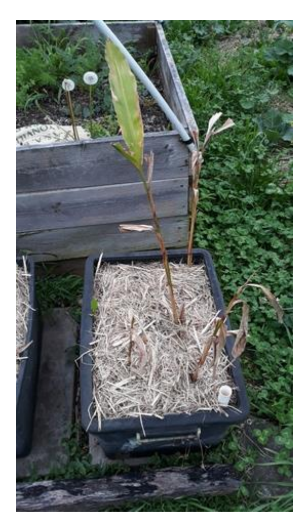
Four weeks on