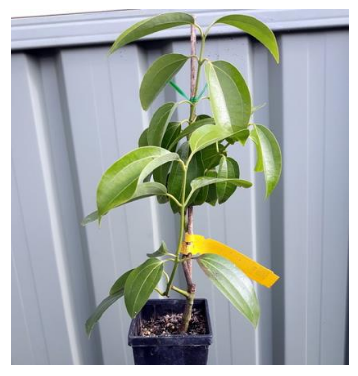
Our brand new cinnamon tree!

A new tree spice has just come in during the last couple of weeks – cinnamon (Cinnamomum verum). Cinnamon is a true tropical tree so it is really an experiment to see if I can grow it in a pot in my greenhouse to the point where it is big enough to actually harvest some cinnamon. At the moment it is only about 30cm high, so it remains to be seen how it will go.