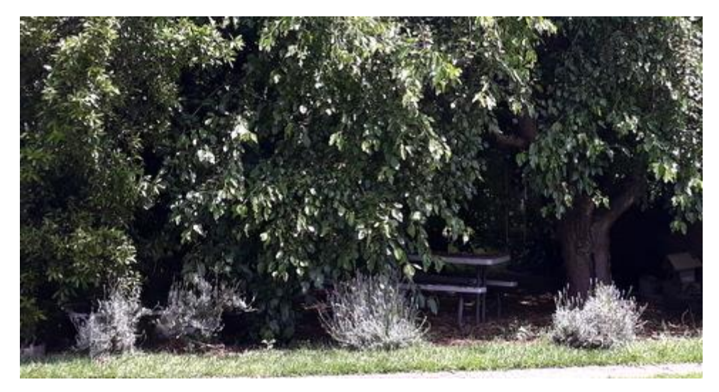
2023 - A bit sparse, needs a revamp!