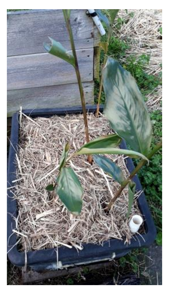
Two weeks on

After some of the cardamom was transplanted into the self watering container, a couple of weeks of cold weather started to make the cardamom look a little unhappy, and a further two weeks of continuing cold weather after that has resulted in some very sad cardamom shoots. Hopefully they will come back from the rhizomes when the weather warms up. However, the original cardamom plants over near the steps and under cover of the banana plants and awning have not changed! Maybe this is the real deal after all!