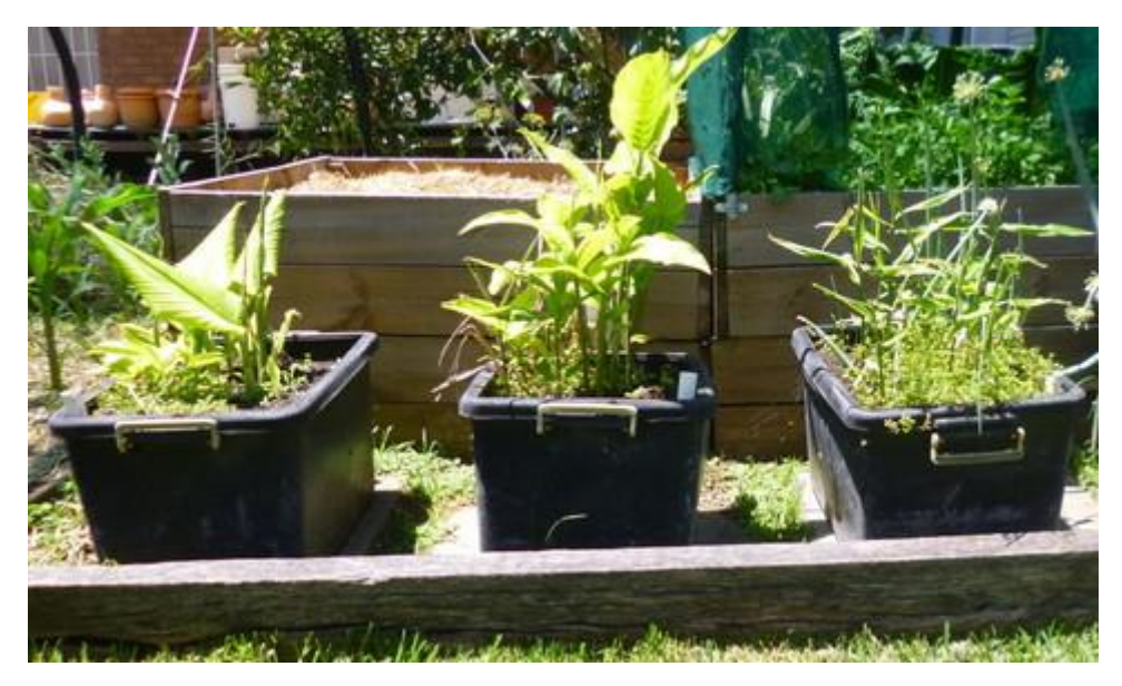
Turmeric, galangal and ginger

These plants are really tropical but because the containers are black and absorb the suns heat, and have their own water reservoir for those really hot days, I thought they would do the job, and in fact they have! First was ginger (zingiber officinale), being the spice I use the most, over 10 years ago and for the most part we have been able t get by with the ginger I grow since. Then over the years came turmeric (curcurma longa) and galangal (alpine galangal) and then finally cardamom (elletaria cardamomum).